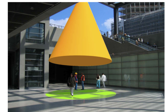
Station Potsdamer Platz, Berlin Station HuangPi Road, Shanghai