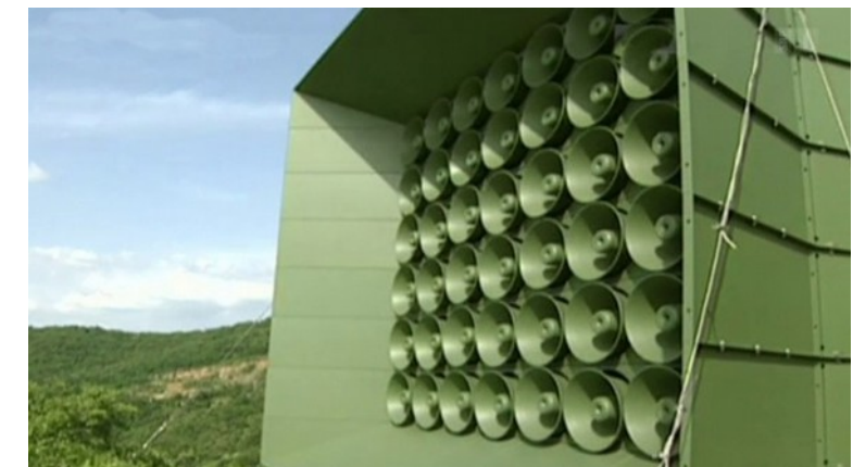
Original loudspeakers at the North/South-Korean border